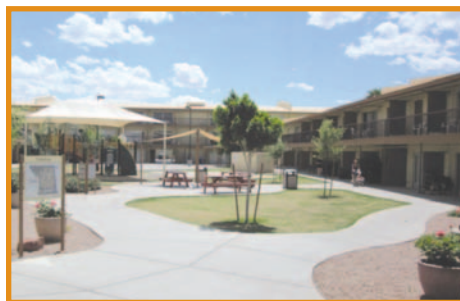
The courtyard at UMOM's new main campus.

Phase I of the campaign successfully raised $18 million to cover the initial costs of renovation and building of the 7.2 acre campus. Phase II is now underway and will raise $5 million to help pay off expenses incurred during