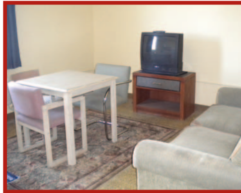
A transitional unit all ready for a veteran family.

case management services. The program is headquartered in two locations, at the UMOM main campus for Central Phoenix and West Valley families and at Save the Family in Mesa to serve the East Valley. UMOM has hired five specialized staff to provide the following services: community