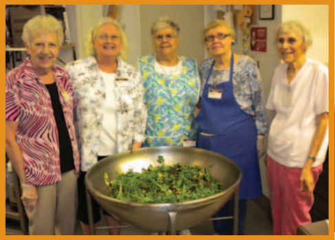
Shepard of the Hills United Methodist Church

We can't help homeless families reach their greatest potential without you. To learn more about volunteer opportunities at UMOM please visit www.umom.org/volunteer or call 602-889-0859. Thank you!