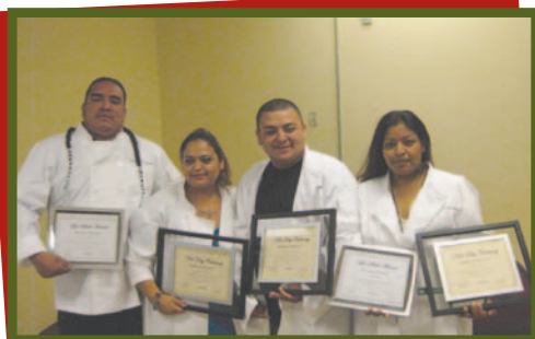
Four graduates of the UMOM Culinary Program celebrate their success in October.