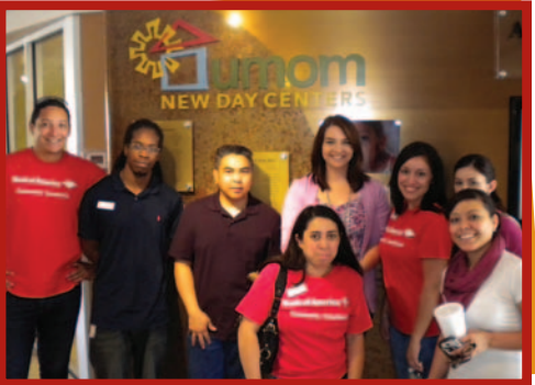
Bank of America