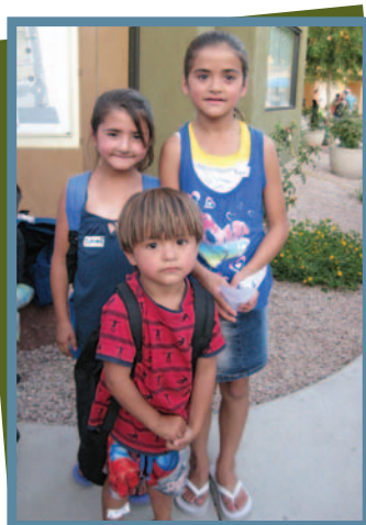
Ready for school with backpacks and school supplies from the Read to Me Back to School Block Party.