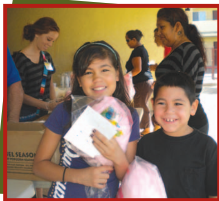
Kids at UMOM had a great time at a carnival hosted by the American Legion Auxiliary in September!