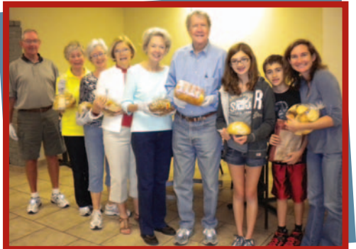
Mountain View Presbyterian Church