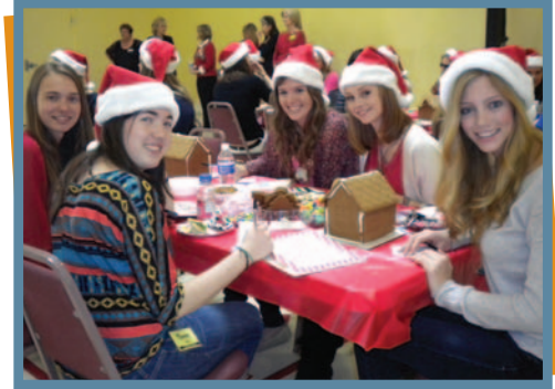
Board of Visitors