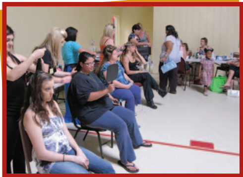
Moms enjoyed makeovers on Mother's Day at the Family is Forever celebration.