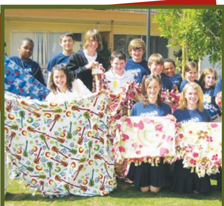
Student Council members from Imagine School West Gilbert present the quilts that they made for families here at UMOM.

The 26th Annual UMOM Children's Charity Golf Event was a big success! Golfers enjoyed a beautiful day at Gainey Ranch Golf Club and raised over $140,000 – a new event record.