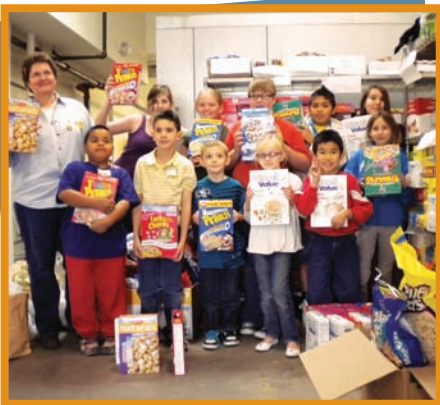
Children from Sirrine Elementary School in Chandler came to deliver the results of the cereal drive they have held for many years. Hundreds & hundreds of cereal boxes feed UMOM residents for months.

The Child Development Center cares for 90 children on a daily basis. This great volunteer opportunity is filled with hugs, laughter and an occasional tear.