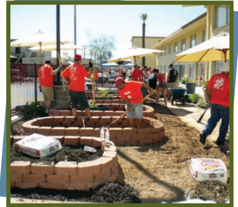
Home Depot volunteers built raised flower beds & bricked walkways around campus.