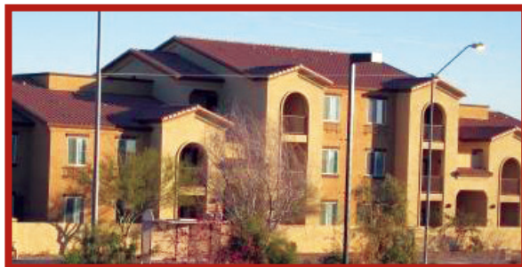
UMOM's newest affordable housing community, The Legacy Crossing, opened in November 2010.