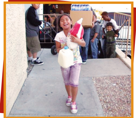
At the Saguaro 'Next Step Housing' site, a happy girl carries her turkey home. Loads of Thanksgiving goods were donated by Kurt & Brenda Warner's First Things First Foundation.