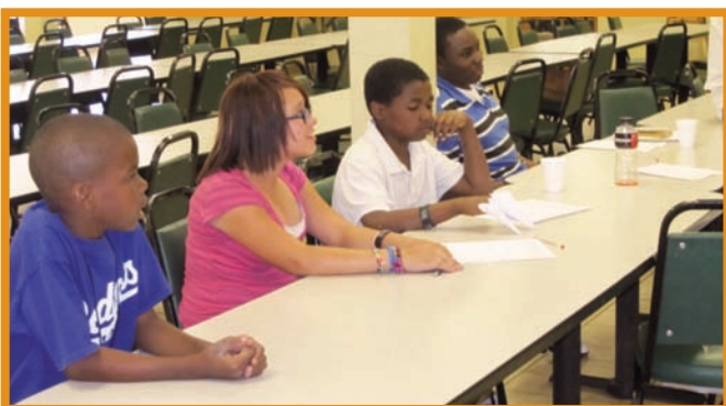
Teens participate in a recent activity as part of the afterschool Teen Activities Program (TAP).

UMOM Youth Services encompass many different programs for children ages 5 to 17 on campus. We have the Kids Den afterschool program for 5 – 10 year olds and the Teen Activities Program (TAP). We also offer case management services, Tutor Club, Book Club,