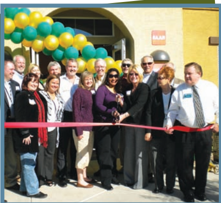
UMOM proudly held the grand opening of Legacy Crossing on the former site of UMOM New Day Centers. Today 79 families call Legacy Crossing their home.

The Women's Auxiliary Birdsong luncheon featured a Japanese theme complete with bridal kimonos. It was attended by 263 people & raised more than $15,000.