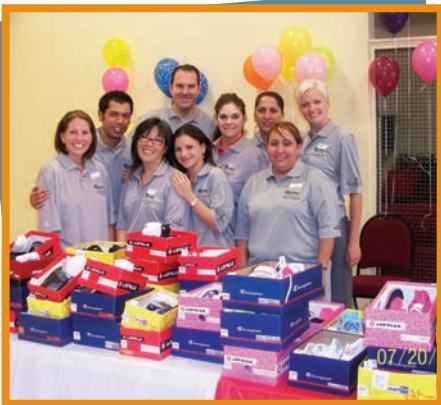
The Back to School Block Party provided donated supplies & clothes for children. Here volunteers from Southwest Airlines distribute shoes contributed by the Sheraton.