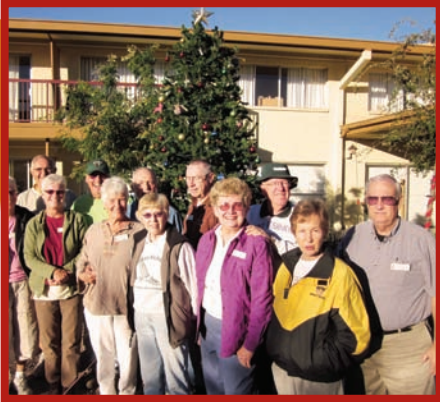
Dedicated faith-based groups from across the U.S. (NOMADS, VIMS & SOWERS), come for weeks at a time to work at the UMOM campus. They are a tremendous asset to UMOM. Pictured here are a group of NOMADS who were with us in December.

Read to Me, the highly successful reading program offered on Tuesday evenings, is a year round hit.