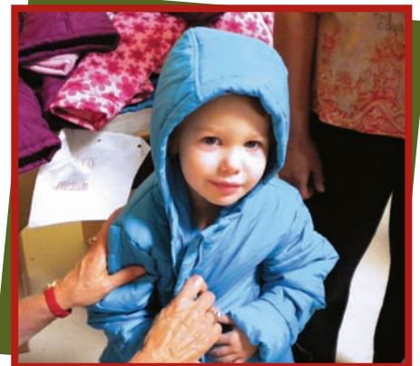
Every child on campus received a new winter coat at the Winter Wonderland carnival sponsored by American Express. The Women's Republican Group donated over a hundred coats for the children.