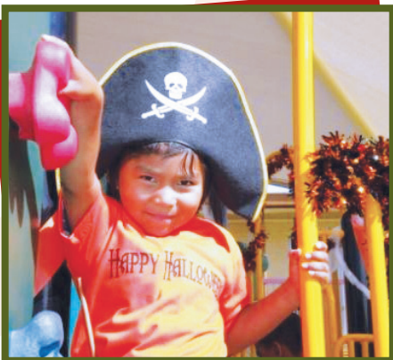
Halloween was celebrated with a party & lots of activities sponsored by the National Charity League (NCL). Argh... there were even pirates on campus!