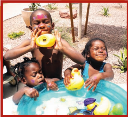
Fun in the Sun, sponsored by many corporate groups, provided opportunities for great fun for all the children & families who live on campus.