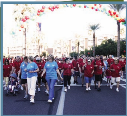
The Women's Auxiliary sponsored the 2nd annual Walk for Homeless Families. It was a great success - attended by 650 people & raised over $50,000!